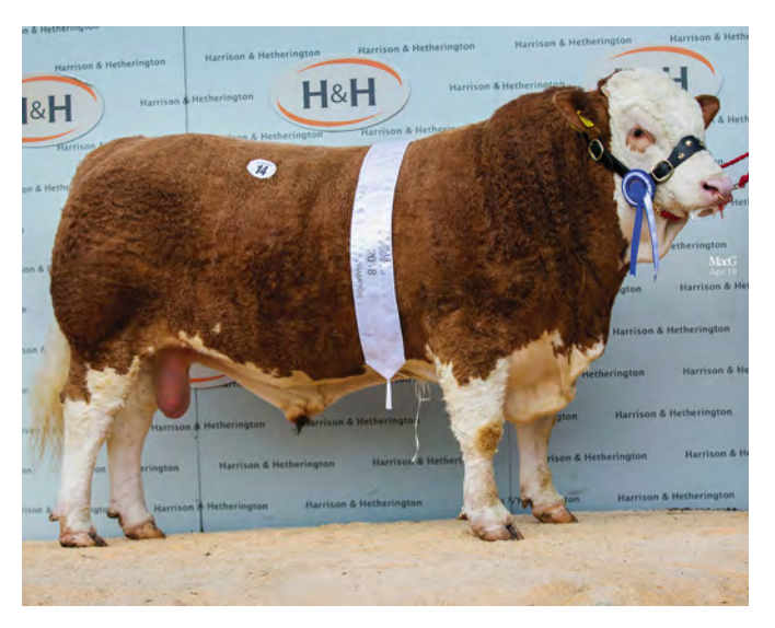
CHESTERMANN HAROLD 16 - Second Top price bull & Reserve Overall Male Champion, bred by N & N Gwynne, sold for 3400gns, commercially - Scotland