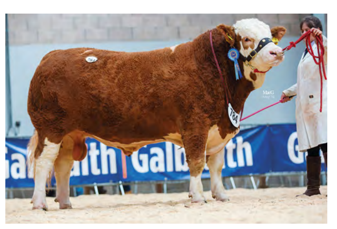
ISLAVALE HANDY 16 - Second top price bull, bred by Mr W S Stronach, sold for 6200gns, commercially - Scotland