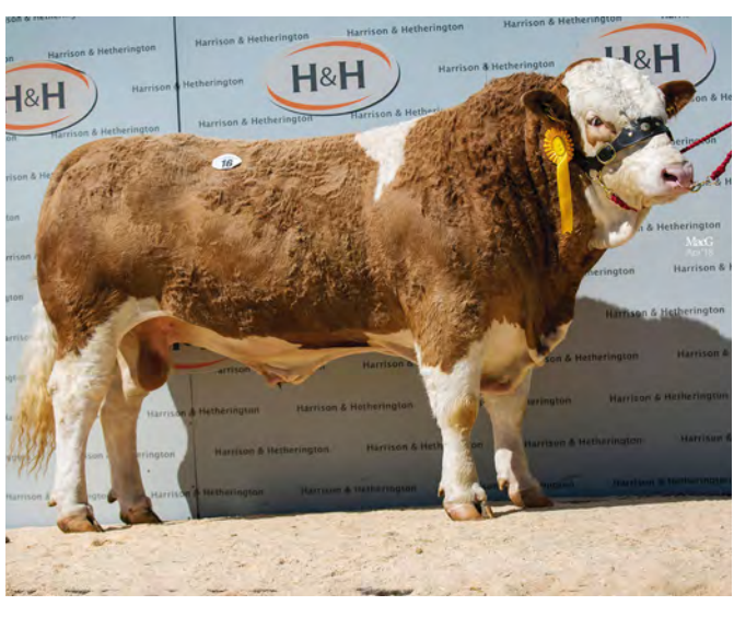
CHESTERMANN HORATIO 16 - Joint Top price bull, bred by N & N Gwynne, sold for 3800gns, commercially – Scotland