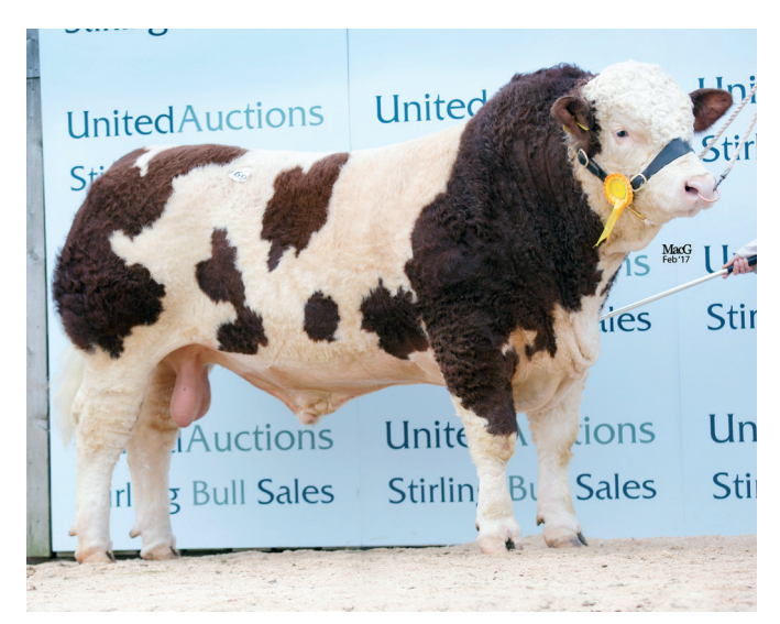
KILBRIDE FARM GREGOR - bred by WH Robson & Sons, sold for 10,000gns to the Maesquoy Farms