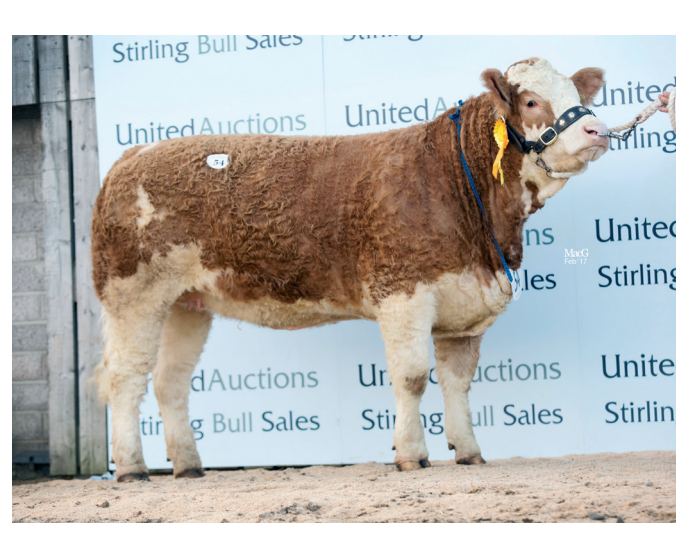
SKERRINGTON RHONA 42ND - top price female, bred by Mr W Young sold for 7800gns to B Chadwick (Chadston)