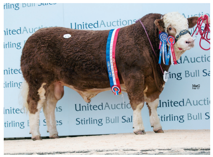
DIRNANEAN GRAFTER 15 - Reserve Overall & Intermediate Champion and 2nd top price of the day, bred by FJ McGowan, exhibited by N Shand, sold for 20,000gns to A Ivory (Strathisla)