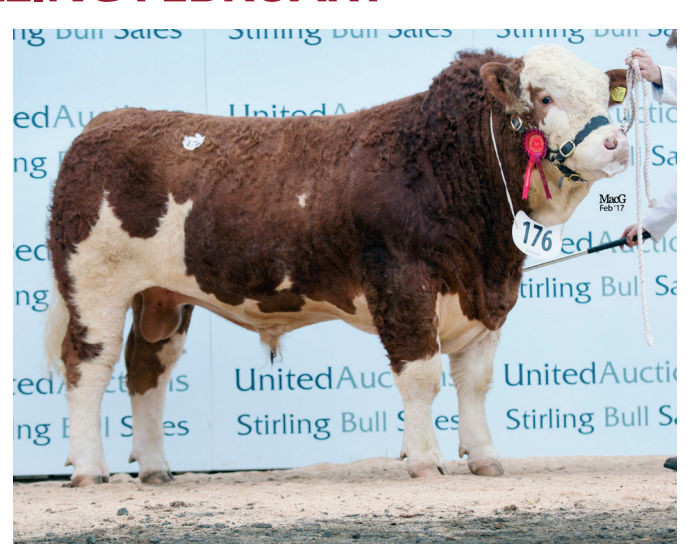
KILBRIDE FARM GOLDSTAR - bred W H Robson & Sons, sold for 12,000gns to B Grant (Dellfield)