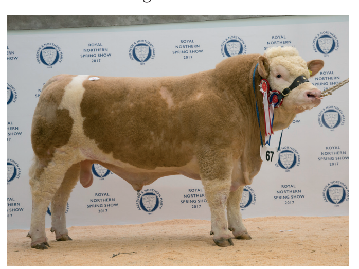
CORSKIE GLOW 15 - Champion and top price bull, bred by WJ&J Green sold for 5500gns to AJ Blackhall

Bulls sold to average £4147.50 89% Clearance