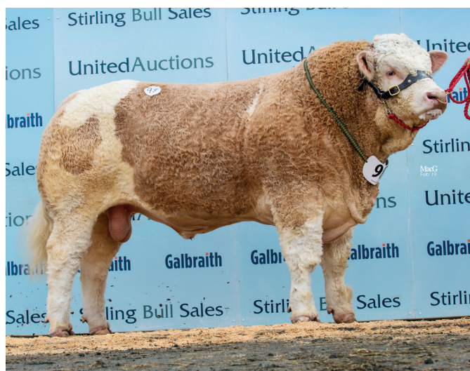
DENIZES IMPRESSIVE 17 - bred by MA Barlow, sold for 10,000gns to JH and VG Wood, Preston. (Popes)