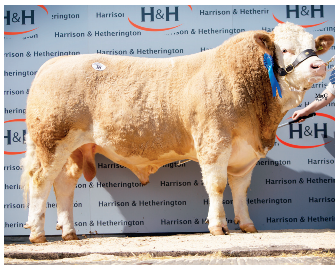
CORSKIE INGENUITY 17 - Bred by WJ & J Green, also sold for 3000gns to Messrs McBryde, Lockerbie