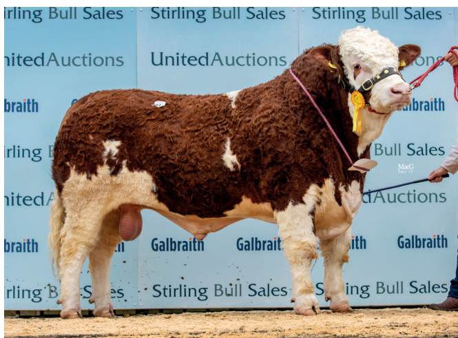
ISLAVALE ILLUSIVE 17 - topped the day's trade at 14,000gns. Bred by Mr WS Stronach, and purchased by HJ Warnock, Carrowdore, Co. Down (Templefyn)

98 bulls sold through the ring to an average of £4975, achieving a clearance rate of 63%, with eight bulls selling to 10,000 gns and over.