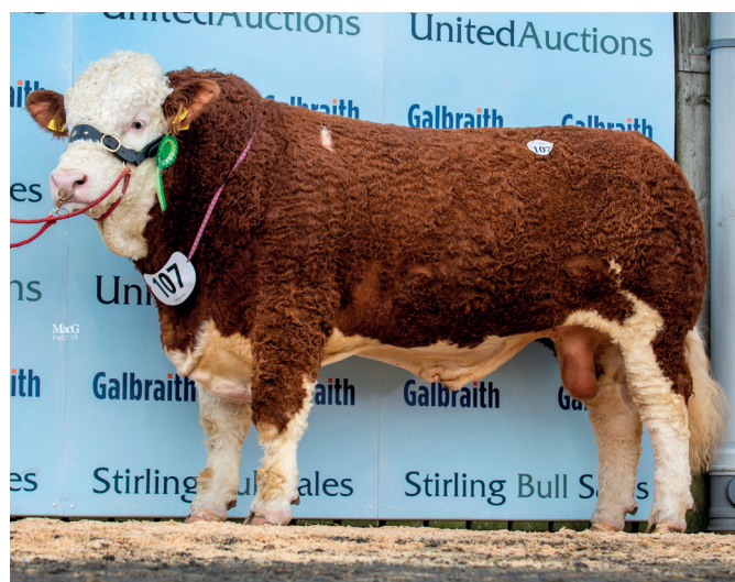
ISLAVALE INPUT 17 - bred by Mr WS Stronach, sold for 10,000gns to MJ & A Mill, Cardenden (Shawsmill)