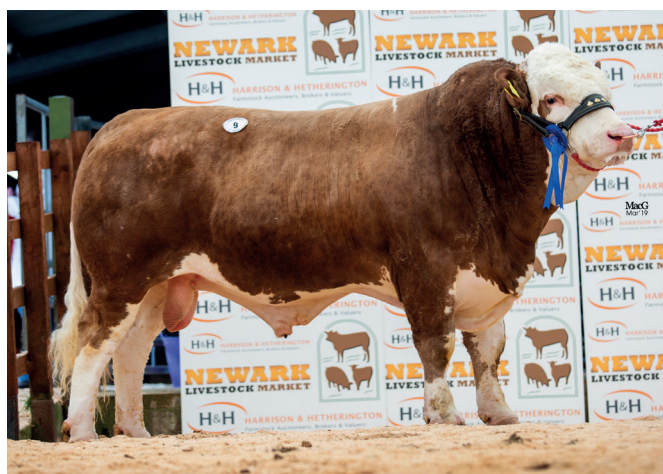
HEATHBROW INFAMOUS 17 - Bred by DA & LA Sapsed, sold for 2800gns to Baumber Park Farms, Horncastle.