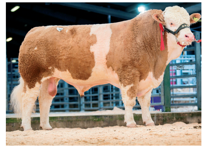
HEATHBROW GOVERNOR 15 - topped the trade of the day for all breeds, bred by D A & L A Sapsed selling for 7500gns to John Lyle (Cambus)