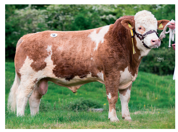
WROXALL GALLOWAY 15 - Second top price bull, bred by C H Evans & Son, sold for 3800gns to C M Mercer (Bowley)