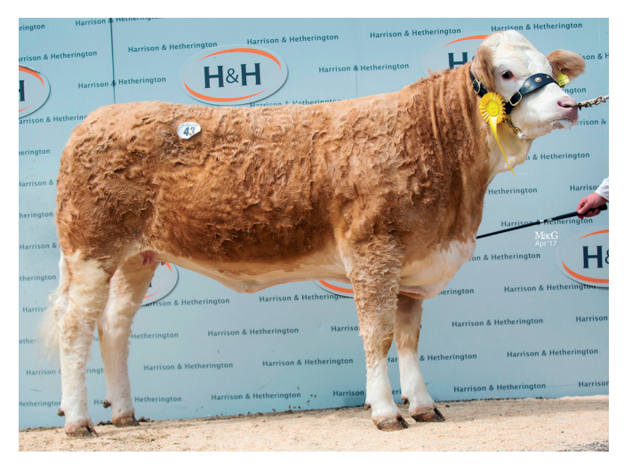
WILLIAMS SNOWQUEEN 8TH - Top price female, bred by Mrs H Clarke, sold for 3600gns to N & N Gwynne (Chestermann)