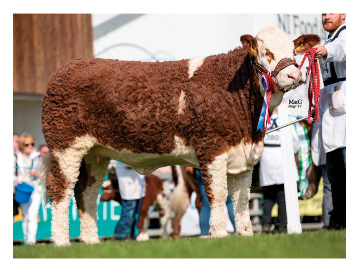
\mbox{LISGLASS GODDESS} - Supreme & Female Champion, bred by J L & C J Weatherup