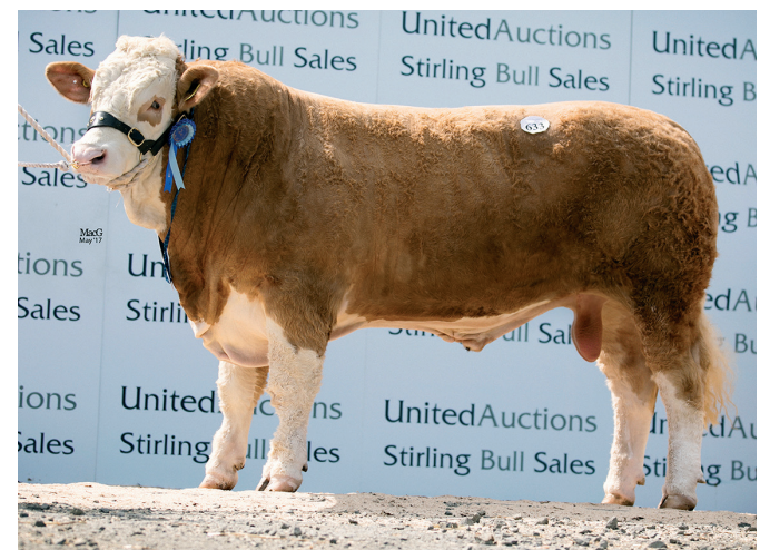
CORSKIE GLOBAL 16 - Second top price bull, bred by WJ &J Green, sold for 7200gns to J S Fraser