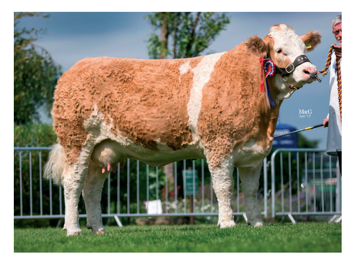
STERLING CELIA'S FIFI - Supreme & Female Champion, bred by Boddington Estates Ltd