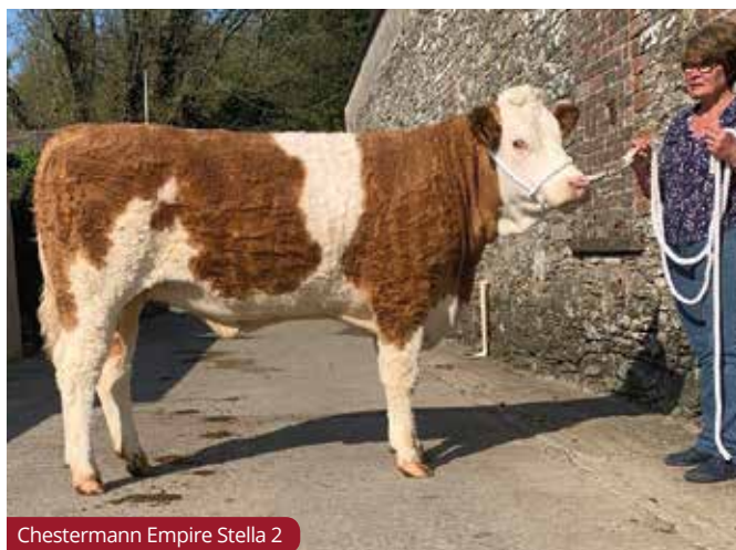
Chestermann Empire Stella 2