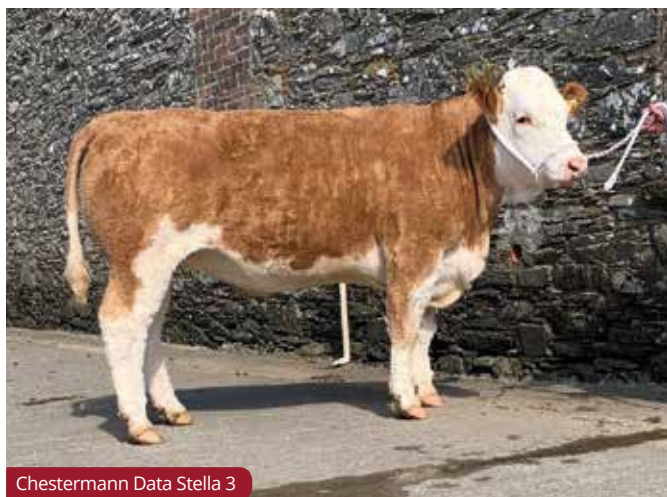
Chestermann Data Stella 3

Please note that the Society has uploaded its social media policy to the website which can be viewed at www.britishsimmental.co.uk under the heading Useful Information. It is further located, also on the homepage, just under the Twitter and Facebook icons. The policy is there as good practise and to give clear guidelines on the use of all social media channels in relation to British Simmental Cattle Society Limited subjects.