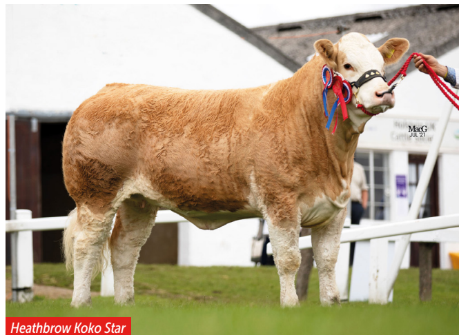
Heathbrow Koko Star