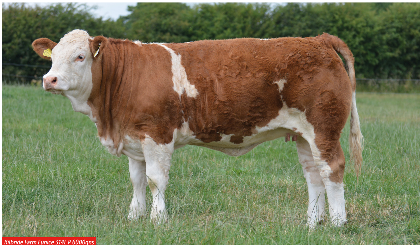
Kilbride Farm Eunice 314L P 6000gns