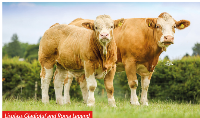
Lisglass Gladioluf and Roma Legend