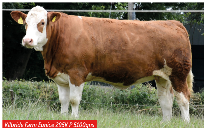
Kilbride Farm Eunice 295K P 5100gns

On offer was a select high-quality catalogue of yearling and in-calf heifers from the herds main and prolific cow families. In the run up to the sale the Robson family had imaginatively and extensively promoted and marketed the sale through social media with in-depth picture and video content of the animals for sale, and with details of their breeding lines. A number of potential buyers also viewed the animals on-farm. The hard work paid off with the sale, held in conjunction with Ballymena Market and the online MartEye, raising worldwide interest. The top priced heifer was purchased by an Australian buyer, with two further heifers heading to buyers in Germany. Four heifers headed to Scotland, with six going south to the Republic of Ireland, and two remaining with buyers in Northern Ireland. Fifteen heifers sold in all to average a very healthy £4886.