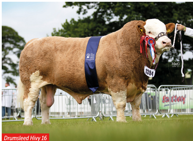
Drumsleed Hivy 16