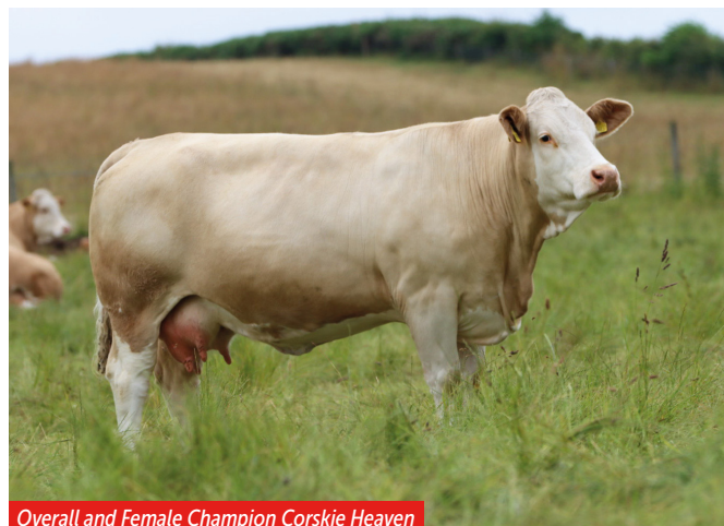
Overall and Female Champion Corskie Heaven

The Simmental 'Virtual' Show was established in 2020 to bring 'some fun and competition' for members with there being no summer show season during the Covid pandemic. Such was the popularity of the competition that the 'Virtual' Show was rolled out for a second staging this year and was supported with a massive entry.