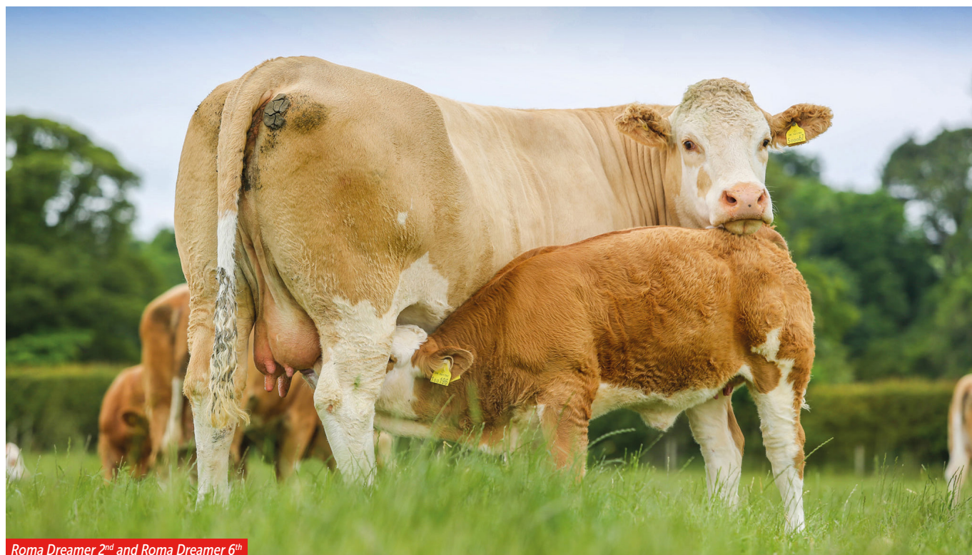
Roma Dreamer 2 nd and Roma Dreamer 6 th

For the full sale report and pictures visit: https://britishsimmental.co.uk/sale-reports/other-sale-reports/