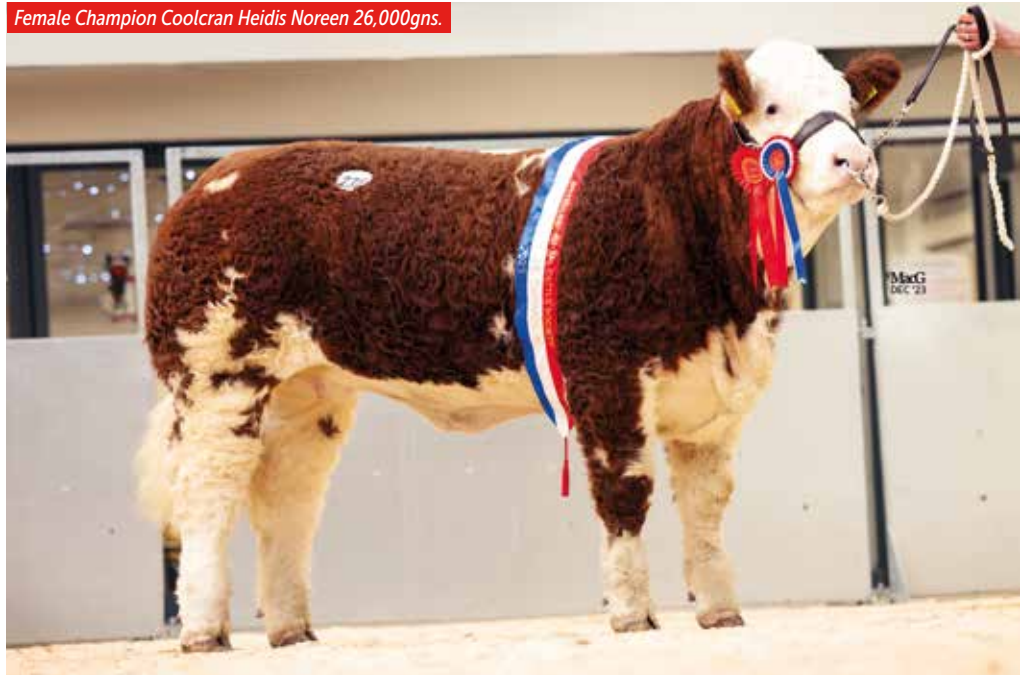
Female Champion Coolcran Heidis Noreen 26,000gns.

The 26,000gns was a new record for a NI Simmental female, and was also a new Next Gen Sale, and Simmental centre record. With four animals on the day making over 10,000gns, the 34 served/maiden heifers sold averaged £5583.53 up by +£363 on the year, and again a new record average for the sale. Three weaned heifer calves averaged £5180, and the one cow and calf in the catalogue made £6300. The sale saw some strong bidding for the quality lots on offer from a combination of existing and new breeders.