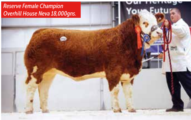
Reserve Female Champion Overhill House Neva 18,000gns.

To see the full sale report and pictures on the Society's website please go to: https://britishsimmental.co.uk/sale-reports/