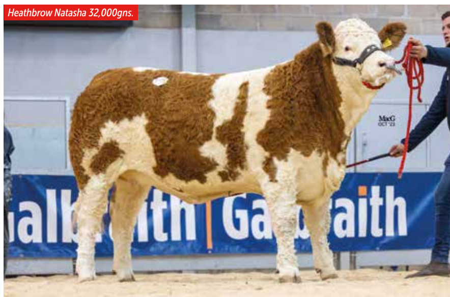
Heathbrow Natasha 32,000gns.